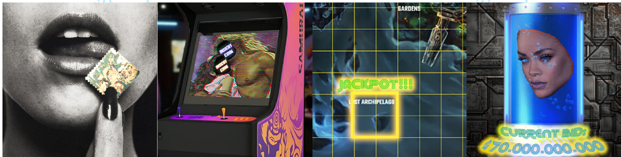
The many forms of entertainment and medical tourism in Ecstacity

He was soon made an example of, his sentence meted out on Live Broadcast. He would never wield a scalpel again.